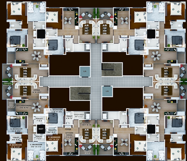
STILT, STILT SECOND & STILT FOURTH FLOOR PLAN

Living Room 16' X 10.3' Kitchen/Dining 17.6' X 9.6' M. Bed Room 12' X 11.6' C. Bed Room 10.6' X 11.6' G. Bed Room 12' X 10.6' Toilet 6.6' X 4' 7' X 4' 7' X 4' Wash Area 5.4' X 9.6' Terrace 6' X 10.6'