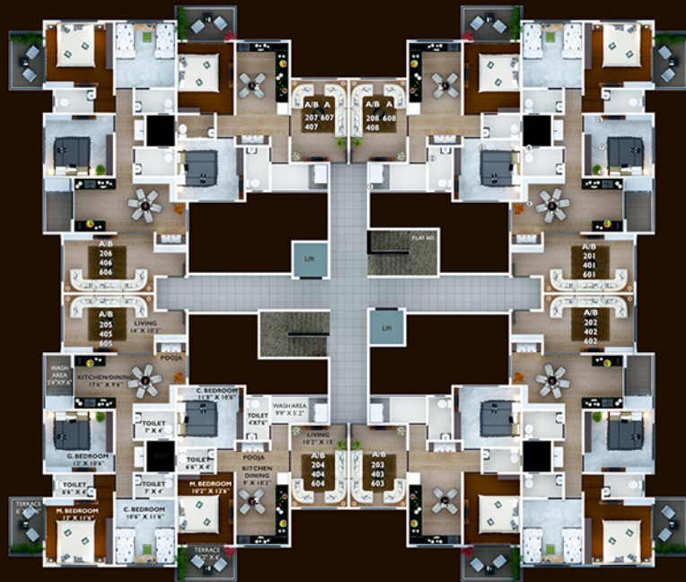
STILT FIRST, STILT THIRD & STILT FIFTH FLOOR PLAN